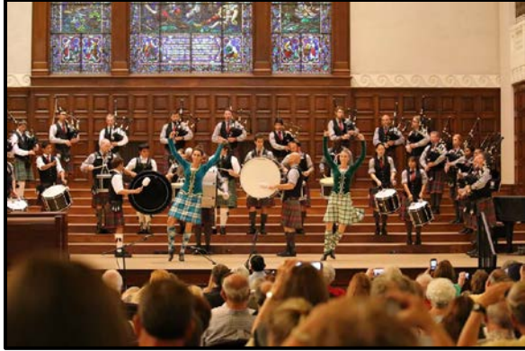
Pipes, drums and dancers perform at The Pipes of Spring Concert