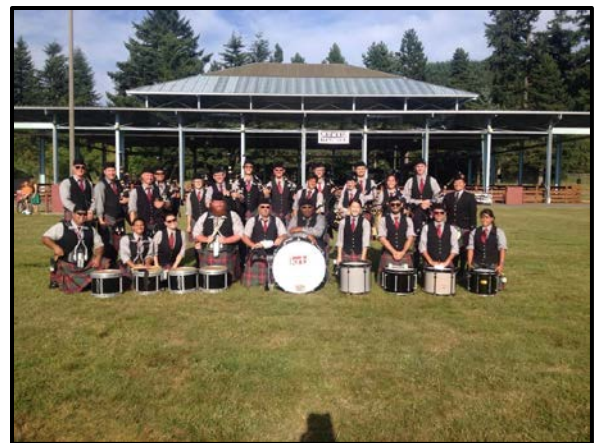
Kevin R. Blandford Pipe Band at the Seattle Highland Games, 2014