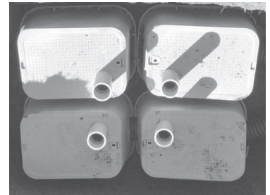
above - Digging burrow ditch right - Burrow setup below - Burrows after Jan 2016