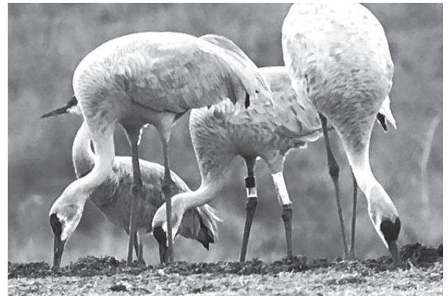
Banded Sandhill Cranes, Hwy 99, Feb 6, 2016