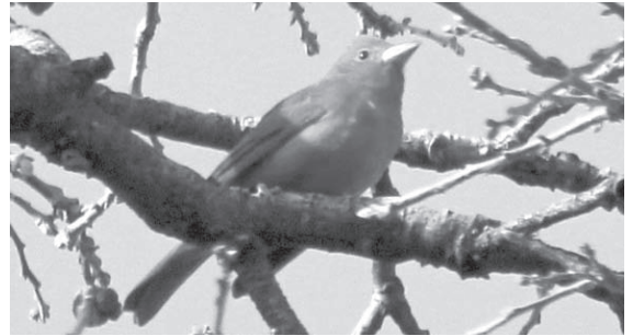
Summer Tanager, Genetic Resource Center, Feb 6, 2106