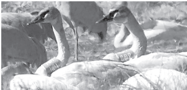
Banded Trumpeter Swans, Hwy 99, Feb 6, 2016