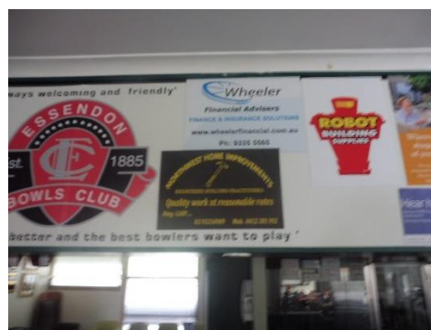
(Sample of advertising above the bar.)