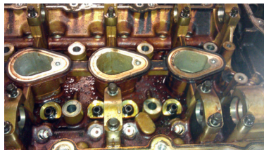
Diesel engine head before.

LIGHT CLEANING: Dilute product up to 1:100 with water. Spray, brush, or wipe solution onto surface to be cleaned. Wipe up solution with clean cloth or towel.