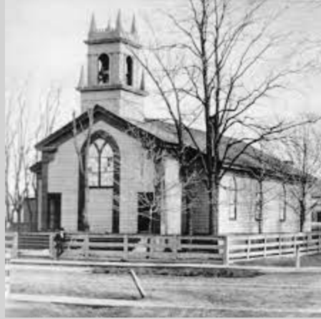
First St. Matthew's Building