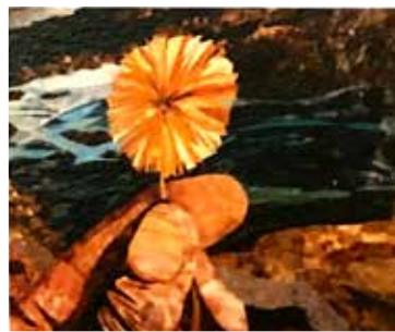
Blowing in the Wind by Chloe Gwinn