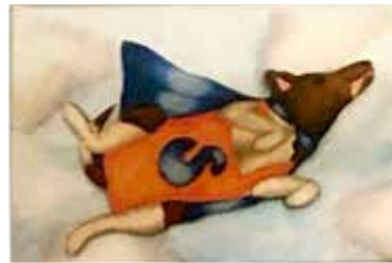
High Flying Super Dog Sydney Troyer