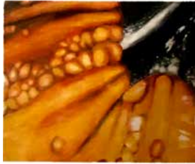
Pumpkin Skin by Elisabeth Bode