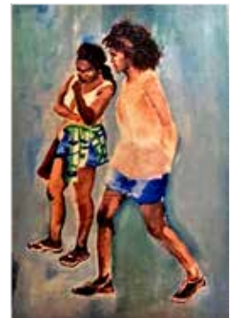
Girls Playing by Tiyanna Echols