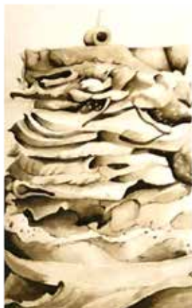
Tasty by Zack Mapp