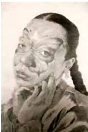
Butterfly Lady by Sasha Harris