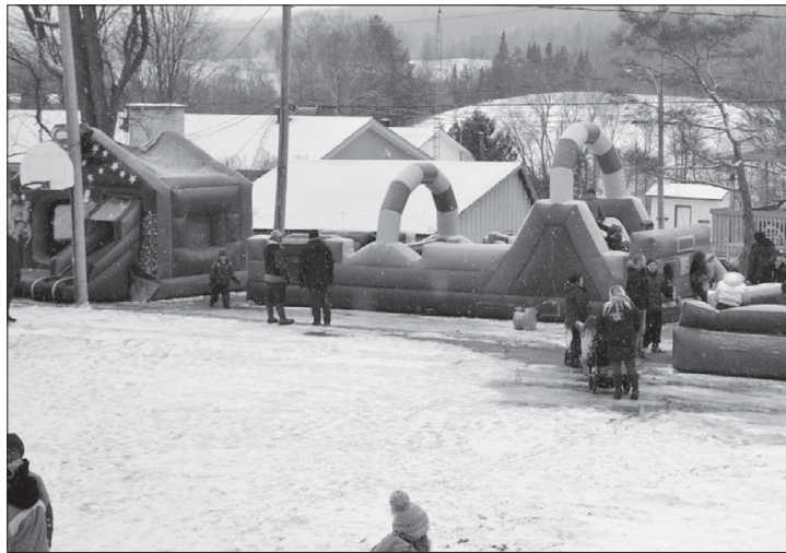
Winterfest family fun day is just one of the events happening during Potton's Festival of Hearts this February...outdoor inflatables, tubing and fun

This February, celebrate heart health with Potton's Festival of Hearts. For more information visit the Potton website at: www.potton.ca