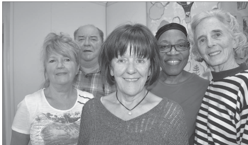
Comité Nutri Santé

The food was colorful, nutritious and delicious and while some opted not to eat it all, many enjoyed tasting the fruits of their labour. While the soup seemed to be a favorite of the younger children,