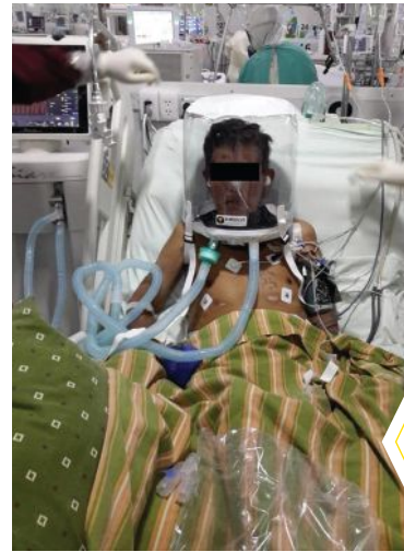
» The Subsalve Oxygen Treatment Hood is an FDA authorized device for treating respiratory distress from COVID-19. It and several supportive apparatuses resulted from a diving technology pivot at the start of the pandemic.

In March 2020, amid the ventilator shortage, there were a number of creative responses that stemmed from diving technology and which had a real impact in the form of both PPE and ventilator support. For my group, our response was to rapidly develop and bring to market the Subsalve Oxygen Treatment Hood for helmet non-invasive ventilation—understanding pressures, volumes, and flows coupled with appreciating how to navigate regulatory pathways (US FDA Emergency Use Authorization) similar