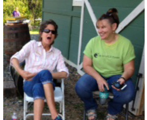
Holly is in the Green