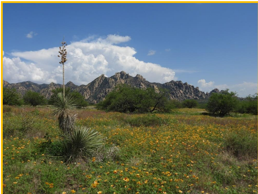
The Dragoon Mountains, Cochise County, AZ