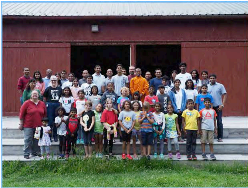
Dhamma Camp for Children, 2019