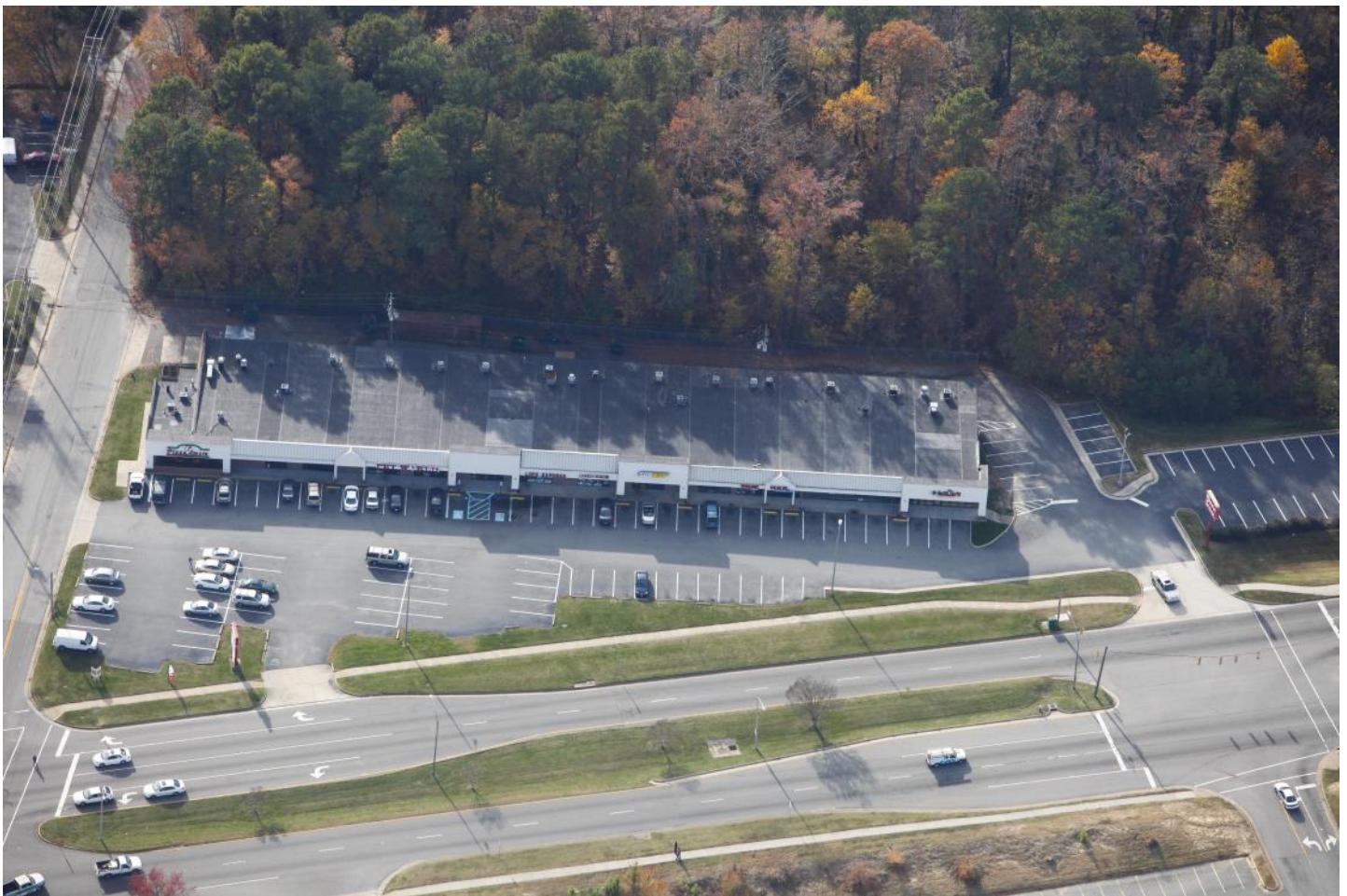
Denbigh Specialty Shops, Newport News, VA