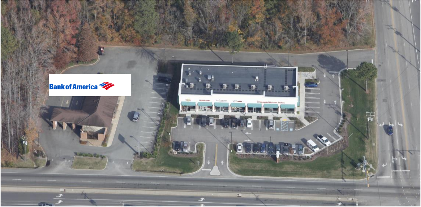
Lakeside 17 , Yorktown, VA