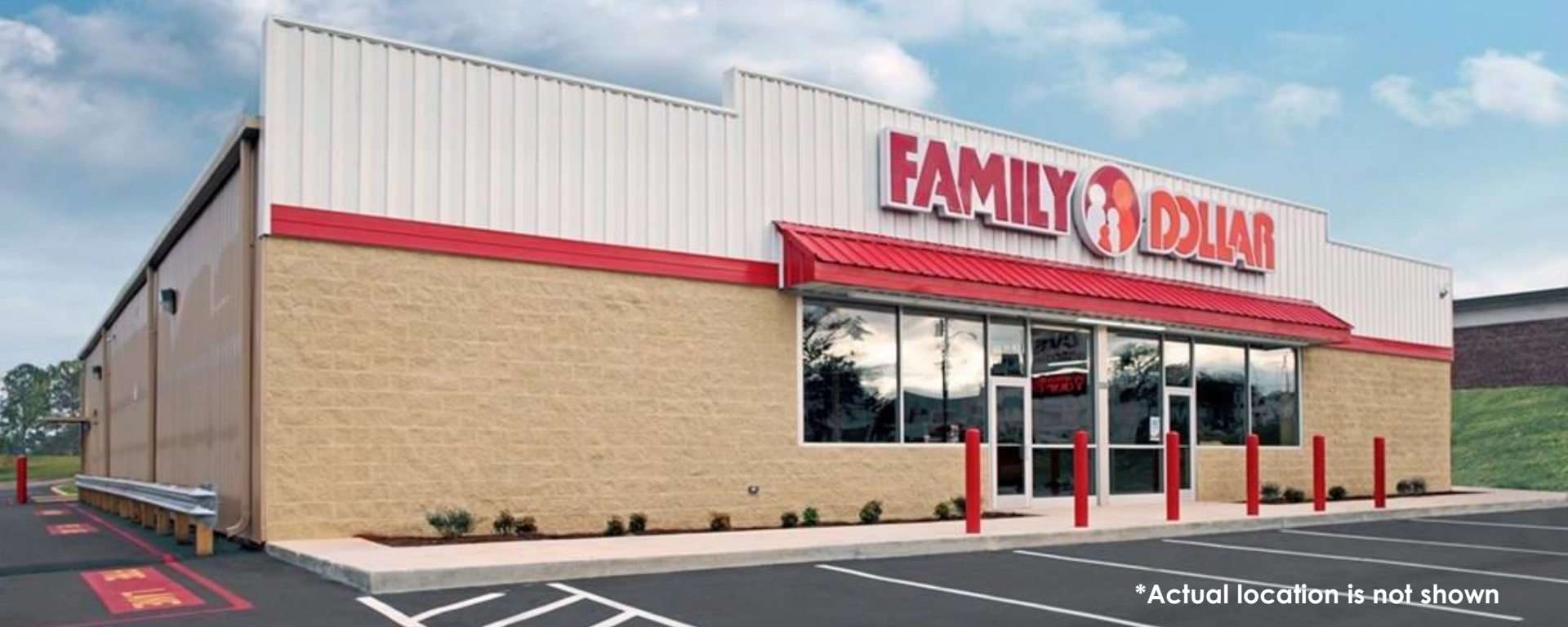
*Actual location is not shown

Ideal for 1031 Exchange Household Income $43K+ Within 5 Mile Radius