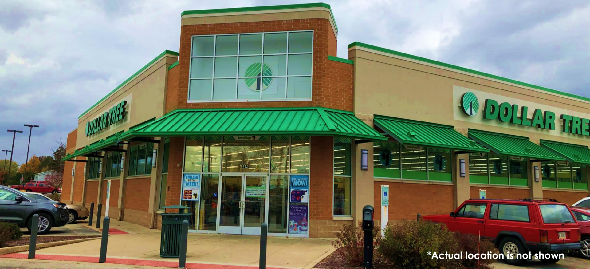
*Actual location is not shown