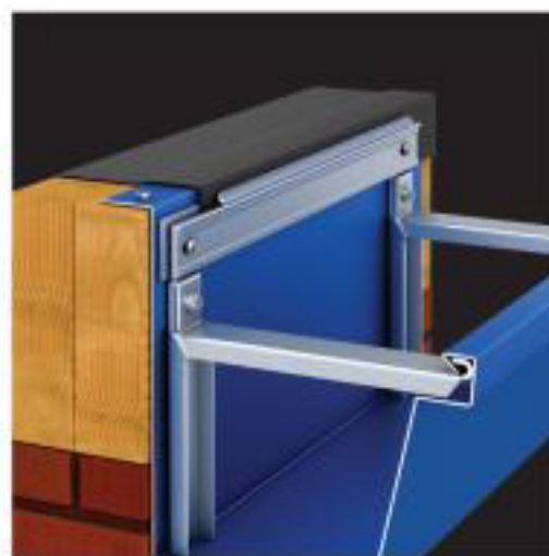
7" Box Gutter