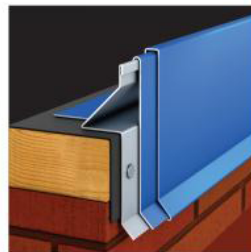
Snap Gravel Stop