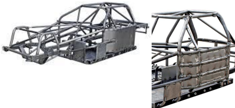
Illustration pictured below.

Plan B – minimum 0.125-inch (1/8") thickness steel plate must be welded to the space between each left-side door bar. Offset chassis right side door bars commonly called the outrigger or the kick-up bar, must be constructed of a minimum 1.250-inch x .065-inch wall round or square steel stock. Front of outrigger bar must go to right front frame behind right wheel. All supporting substructure must be constructed of 1-inch x .063-inch wall round or square steel stock. No material substitutions permitted.