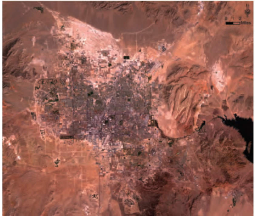
Figure 2. Landsat scene from Las Vegas, NV (April, 2000 - natural color).

Remote sensing products often act as an additional input layer for numerous environmental studies (e.g. hydrology, biology, urban planning). It is often the case that non-experts have high expectations from remote sensing products without realizing potential sensor, acquisition and classification limitations. Therefore, there is a clear need to incorporate advanced accuracy metrics associated with remote sensing products that express usefulness and limitations of incorporated methodologies. Various works already have realized the benefits of spatially-explicit accuracy metrics (Foody et al. , 1992; Canters, 1997; Steele et al. , 1998; Carpenter et al. , 1999; Pontius, 2000; Alimohammadi et al. , 2004; Liu et al. , 2004; Aires et al. , 2004). Integrated frameworks naturally support variable