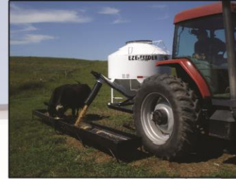
Model 70 on HD 3-point frame