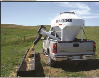
Model 45 with optional spout extension