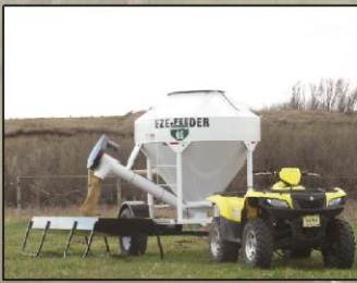
Model 45 on trailer kit