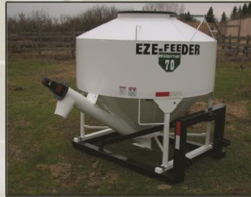
Model 70 with hydraulic discharge auger and HD 3-point hitch