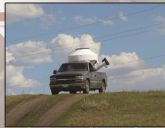
Model 45 in pick-up