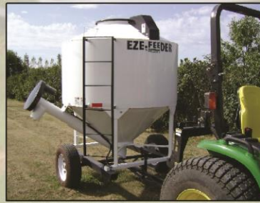
Model 95 with optional 12 V remote lid and trailer kit