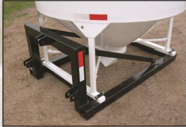
3-point hitch, category 2