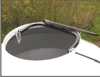
The improved lid opener keeps the lid low and provides a obstruction free opening for filling.