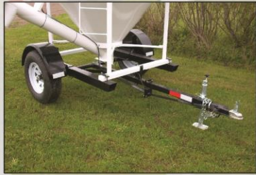
Model 45 on trailer kit with 2" ball coupler, jack and fenders