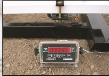
6,000 lb. scale with digital readout. Save on feed cost by feeding precisely how much your livestock needs.