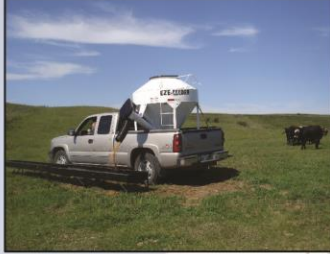
Model 45 in short box pick-up