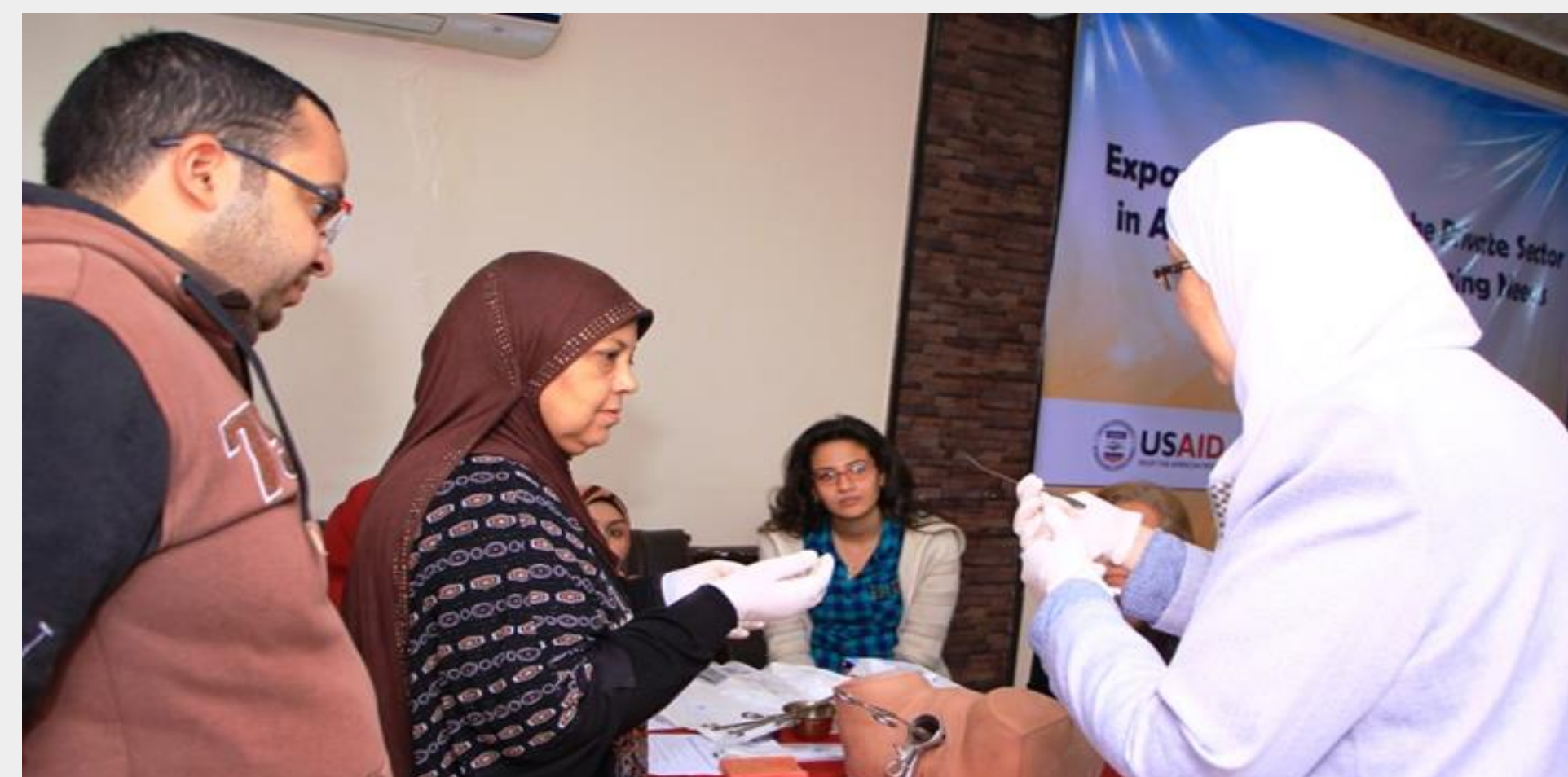
A group of physicians being trained on IUD insertion using models, January 2018

As a result of this project, 55 nurses, 183 pharmacists, and 38 physicians were trained from 133 facilities. Using a monitoring checklist, an increase in items focused on during the training was observed compared to the baseline assessment. Peer educators and factory nurses mainly referred factory workers to NGOs while pharmacists referred clients to private clinics.