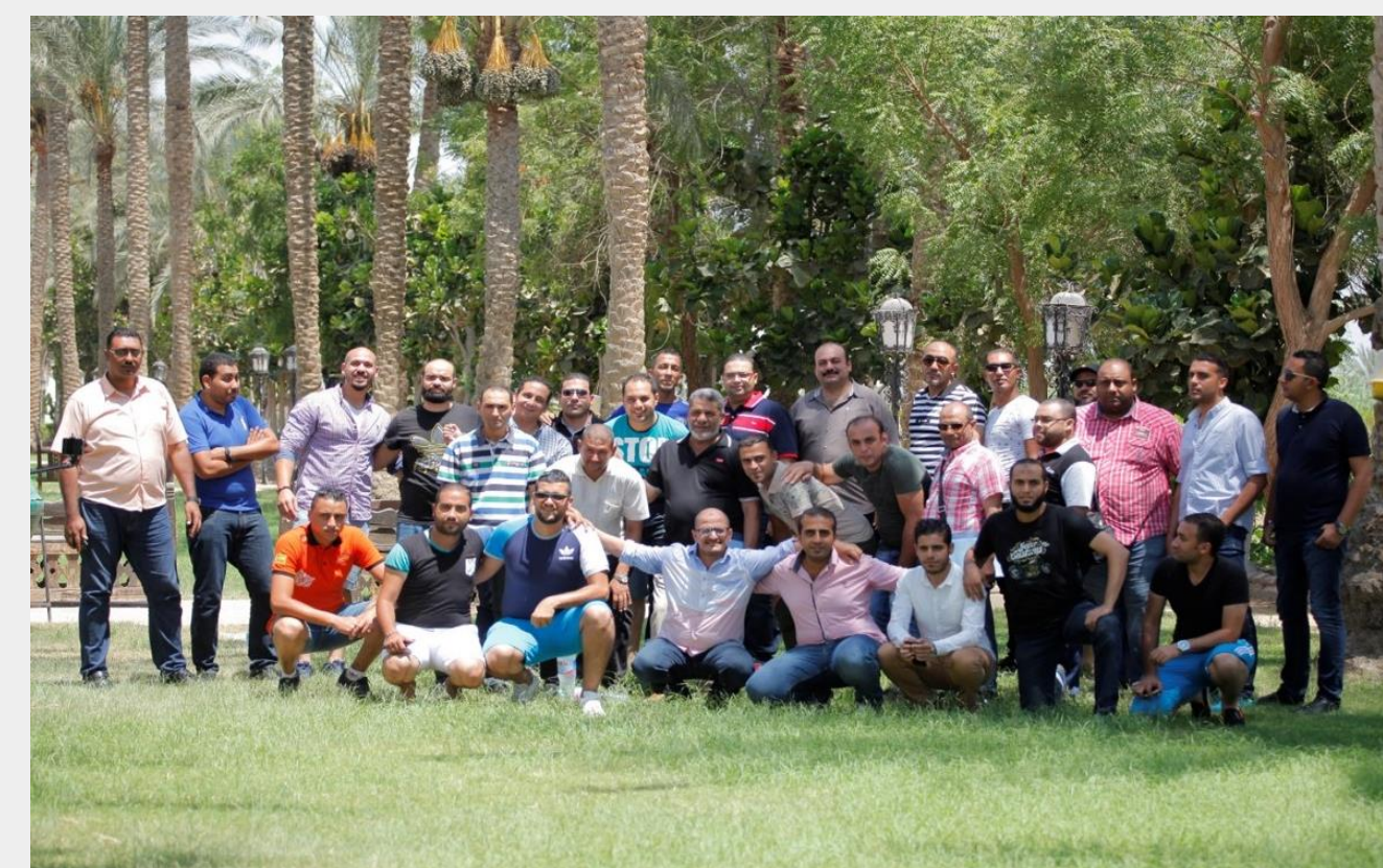
Two groups of peer educators that were trained in Abu Sultan Fayed, July 2017