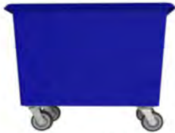
Baseless available on 6-12