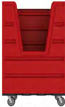
BLT 72 EXT