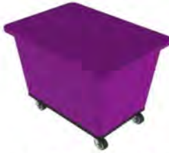
Lids Available for all models