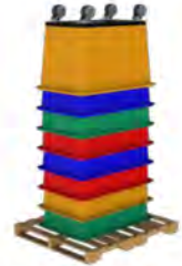
Stackable for Shipping Savings