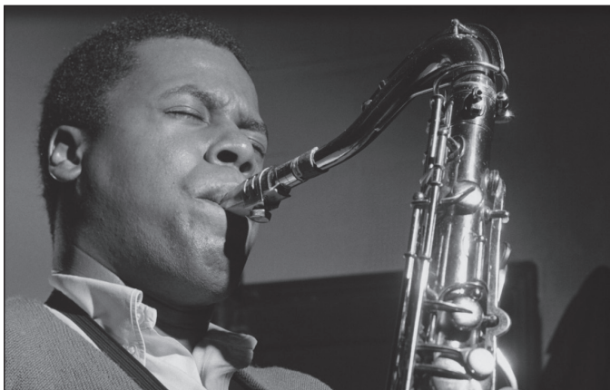
Wayne Shorter at Stanford Festival

This year's Monterey Festival, September 20-22, as usual has wall-to-wall jazz headliners, including Diana Krall, Wayne Shorter, Bobby McFerrin, the Clayton-Hamilton Orchestra, George Benson, Joe Lovano and Dave Douglas, and many more. Arena and Grounds packages go on sale May 21. Single day tickets on sale July 8. Lovano serves as this year's artist-in-residence; Douglas is the showcase