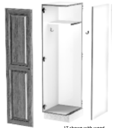
1T shown with wood raised panel and ladder base