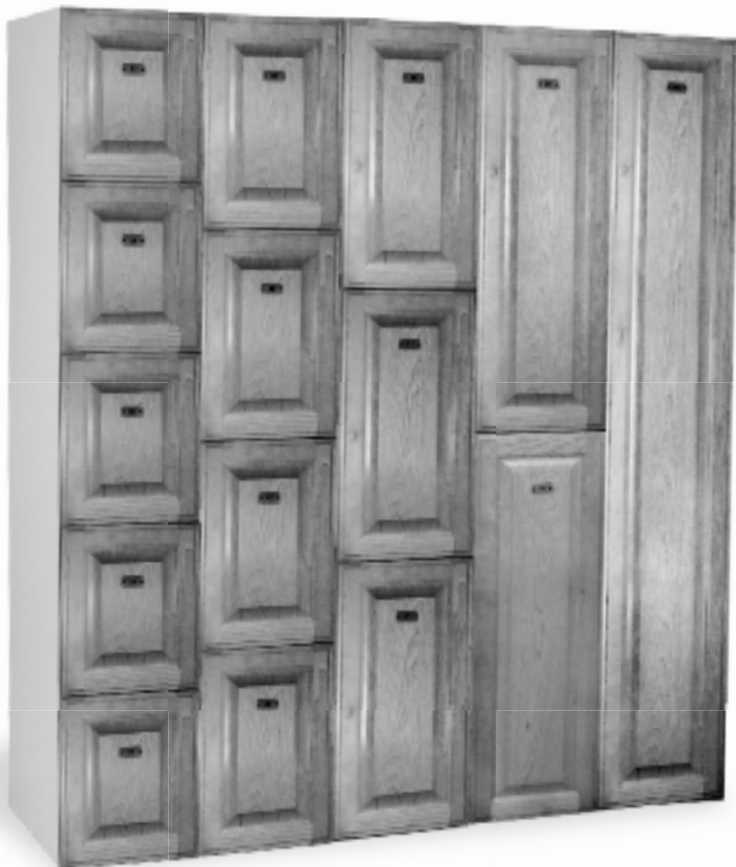
1T-6T shown with oak wood raised panel

W: 12, 15, 18, 21, 24" H: 48, 60, 72, 84" D: 12, 15, 18, 21, 24" 5 Compartments each with: Door, Right European Hinge