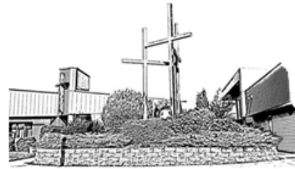
Kason United Methodist Church