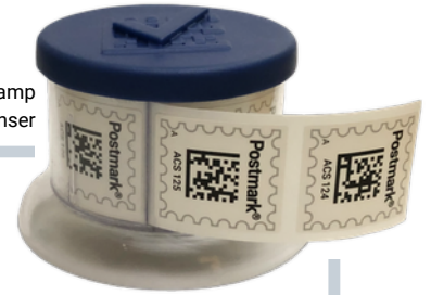
Postmark Stamp dispenser