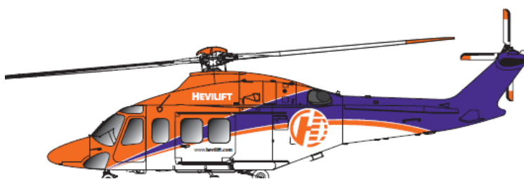
Right Hand Side

The aircraft features leading edge technology, including a Honeywell Primus Epic fully integrated avionics system and 4-axis digital AFCS and benefits from the best-in-class power reserve. It has outstanding power to weight ratio, which provides Category A performance capabilities.