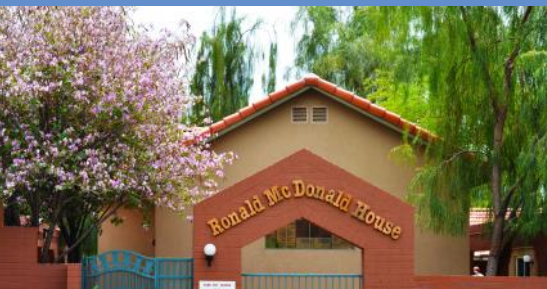
Roanoke House (Phoenix) 44 rooms | Est. 1985

We offer 78 rooms Valley-wide across our three Houses