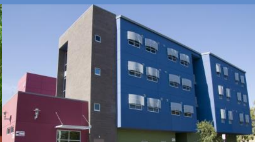
Casa Cambridge (Phoenix) 18 habitaciones | Est. 2008