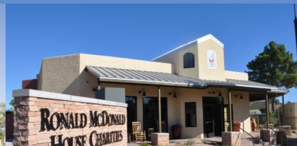
Dobson House (Mesa) 16 rooms | Est. 2014