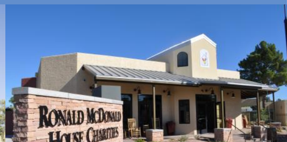
Casa Dobson (Mesa) 16 habitaciones | Est. 2014