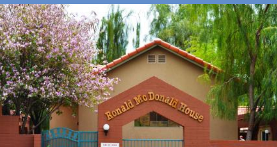
Casa Roanoke (Phoenix) 44 habitaciones | Est. 1985

Ofrecemos 78 cuartos en el área de Phoenix en nuestras tres casas