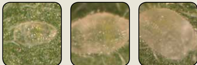
Untreated whitefly nymphs