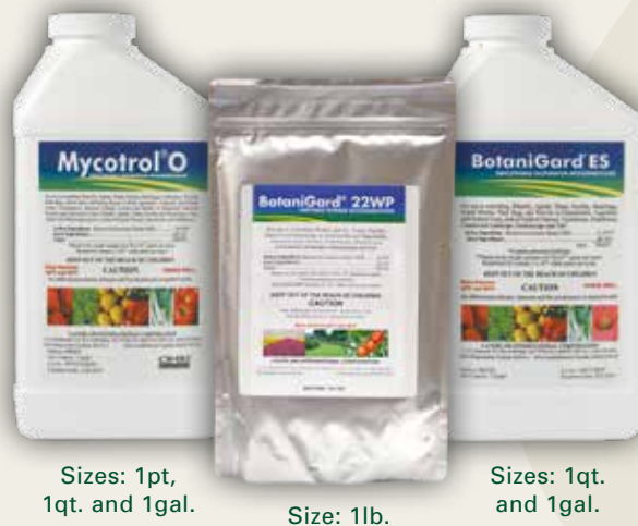
Sizes: 1pt, 1qt. and 1gal.

BotaniGard's mode of action is unlike any conventional insecticide. The applied spores infect directly through the outside of the insect's cuticle (the skin). Spores adhering to the host will germinate and produce enzymes that attack and dissolve the cuticle, allowing it to penetrate the skin and grow into the insect's body. As the insect dies, it will change color to pink or brown, and eventually the entire body cavity is filled with fungal mass. The most common visible indication of insect death is a discoloration of the larvae or pupae. It is not necessary for a white fungal growth to occur to know the product is working; the insect is killed before this happens.