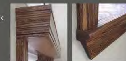
Valance and bullnose edging detail