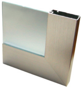
b front view of framed aluminum door with acrylic insert