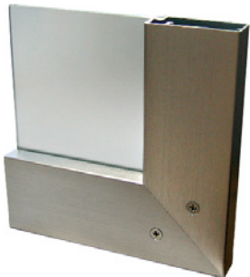
c back view of framed aluminum door with acrylic insert