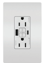
radiant GFCI USB