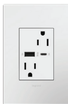
adorne Ultrafast USB