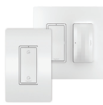
radiant with Netatmo