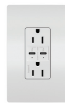
radiant Power Delivery