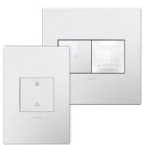
adorne with Netatmo