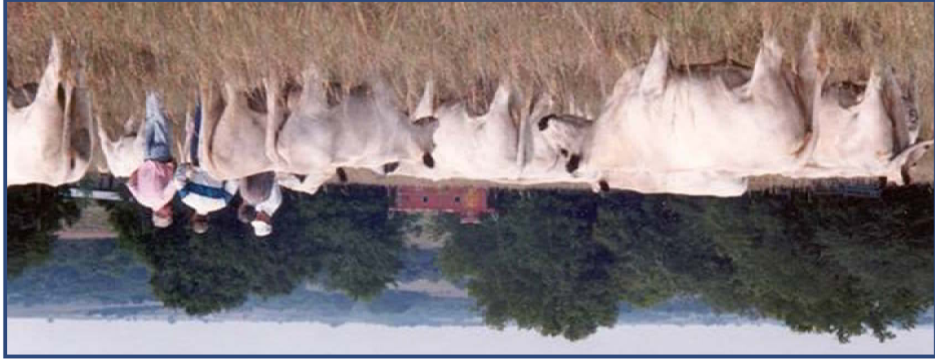
BWCAA Board Members touring a British White herd. Note how gentle & without stress the cattle are. And this is with a group of strangers walking through them. This is a natural trait of the breed.