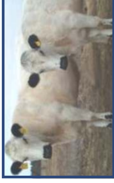
Standard Marked British White Pair. A 13 year old British White Cow with her coming two year old heifer. An exhibit of longevity and consistency.

British Whites are a Rare Old English breed maintained with and selected for those beef cattle traits so needed in today's cattle industry.