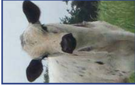
A good growthy, well marked heifer. Age 56 days.

Docile. British Whites are possibly the most gentle cattle of any beef breed. This trait alone makes them your ideal choice whether you raise cattle as a hobby or on a commercial basis. Research has proven that gentle cattle do better on feed and hang a better carcass.