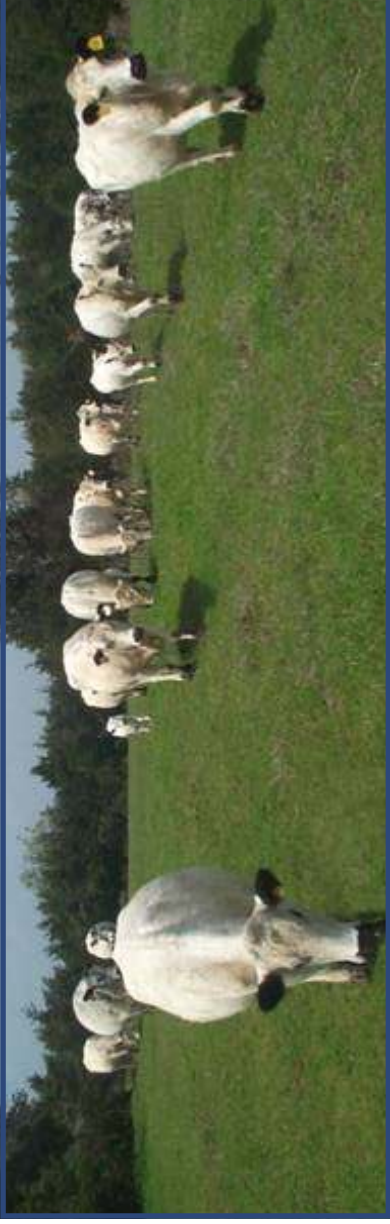
Moving to another pasture, note their gentle nature & willingness to follow.

Fertility, Easy Calving & Excellent Milking Ability. The single most economic trait in the Beef Cattle Industry is the ability of a cow to give birth to her first calf at two years of age and then give enough milk to raise it on her own. Her second and each subsequent calf should arrive within 12 month intervals.