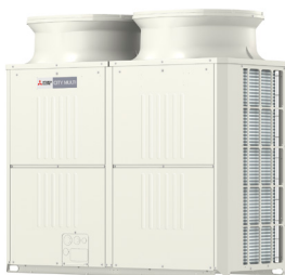
OUTDOOR VRF HEAT PUMP WITH HEAT RECOVERY SYSTEM