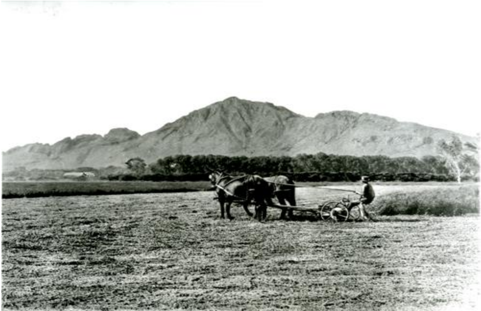
A farmer plowing agricultural land near Camelback Mountain in Phoenix (1918).