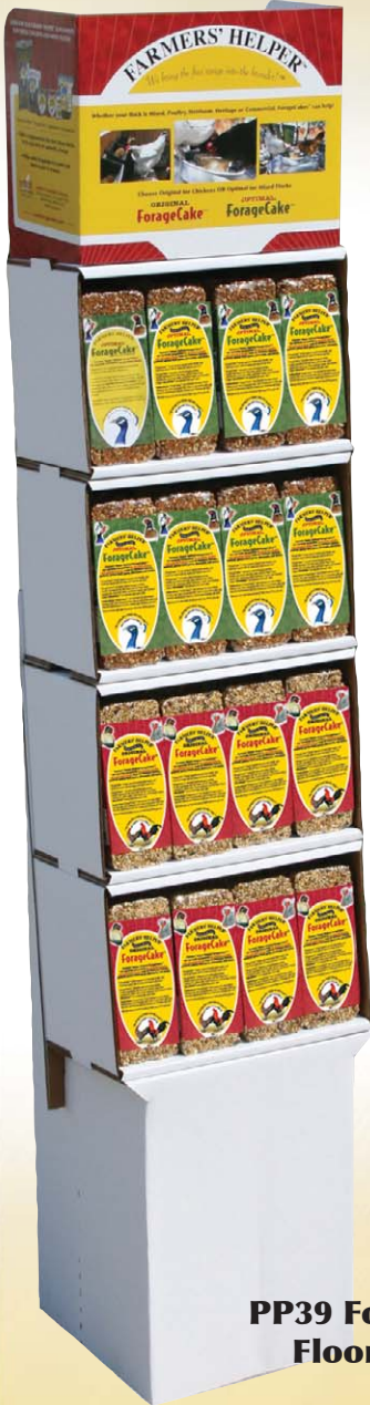
PP39 ForageCake™ Floor Display

Specially formulated for premium poultry and game bird flocks such as chickens, turkeys, peafowl, guinea fowl, geese, pheasants, and ducks.