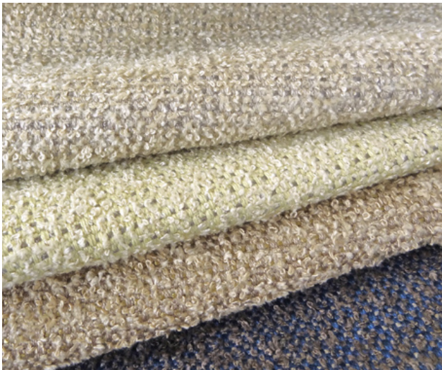
Dune | Moss | Cashew | North Sea