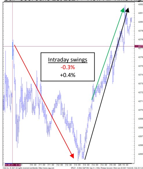
S&P 500: June 28, 2021 > New All-Time High

We take great pride in protecting investors when they need it not when they don't. June 28 th , 2021 was an example of this, as is our live track record during the most historic moves ever seen in the history of the stock market.