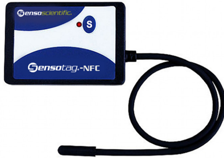
SENSOTAG ® -NFC