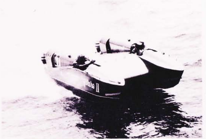
Third was the British cat "Volare II".