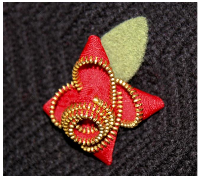
December's make and take project "zipper flowers."