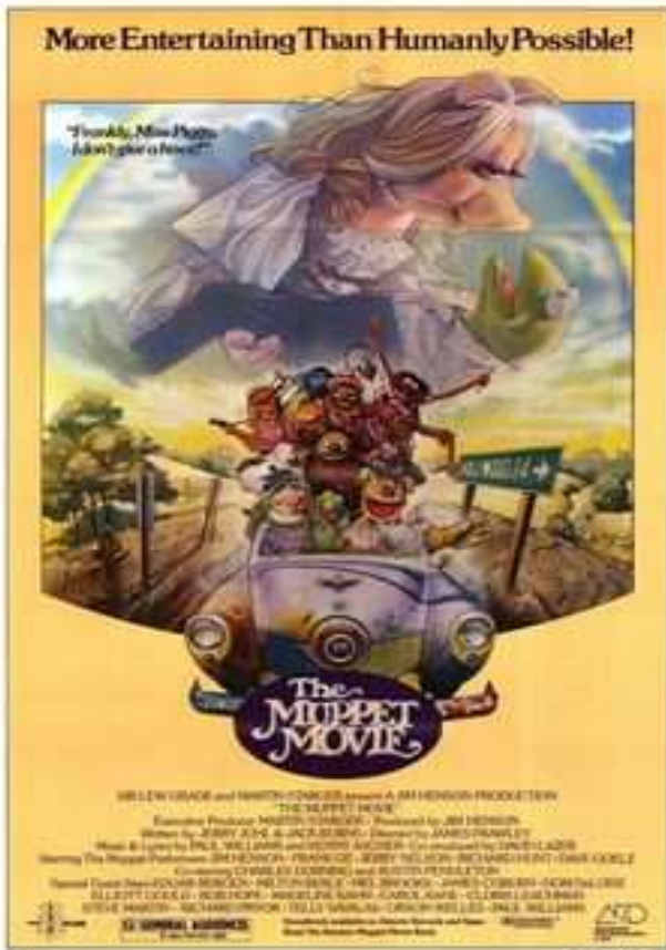
The man behind your favorite movie poster