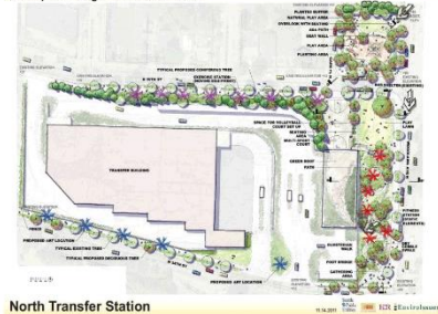
Conceptual Design: Twine with a Twist

P&M with HNTB as prime was awarded this contract to support Sound Transit's (ST) Construction Manager. P&M provided construction scheduling and was tasked to review the General Contractor baseline and monthly progress CPM schedules, monitor construction progress in the field, validate progress payment request and perform time impact analysis (TIA) on multiple projects. Projects included the Lakewood Layover Expansion Design-Build, the Tacoma Trestle Track & Signal Replacement, and the Point Defiance Rail Line Upgrade between Lakewood and Nisqually.