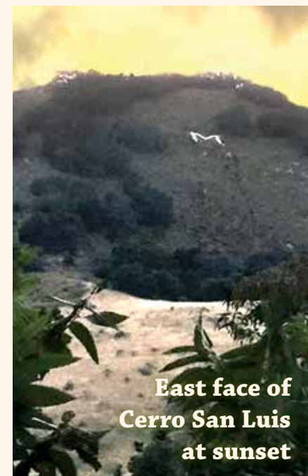
East face of Cerro San Luis at sunset