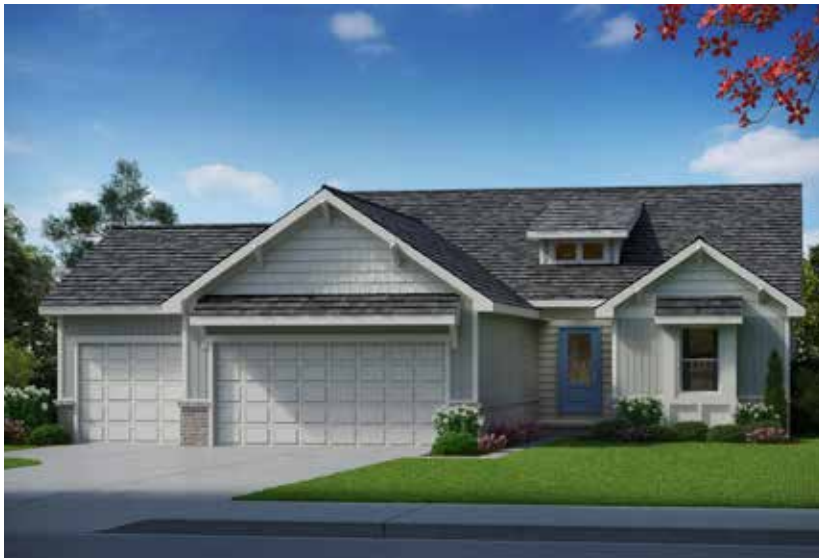
ELEVATION OPTION C