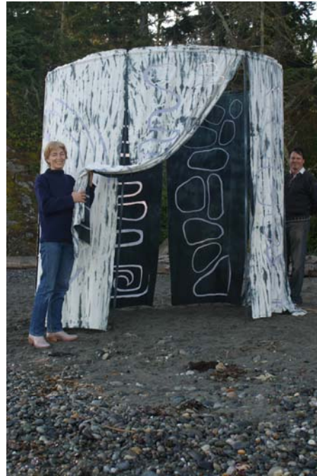
© Maura Donegan - Theme: Landscape and monuments of the Boyne Valley

Students will design items of an advanced nature and acquire a range of practical skills supported by a thorough knowledge of materials, techniques, and processes.