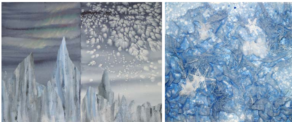
© Bobbie Larson - Theme: Winter, Right: Sketchbook Pages, Left: Manipulated Fabric