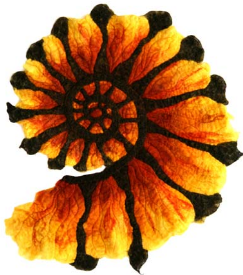
© Janine Hunt - Theme: Geomorphology - Felted Wall Hanging

Student work is evaluated in an ongoing way during class sessions, at tutorials, and occasionally through correspondence. A Logbook will be kept by each student to track ongoing progress and sign offs on each project. No letter grades are given for performance in the courses at our center. The course is very British and generally conceived along the lines of the Oxford Don system. That is: classroom instruction, independent work, and tutorials with the instructor, are all a part of the instructional concept.