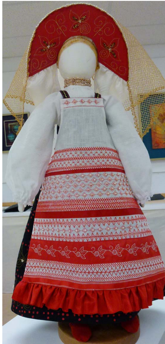
inspired by her Russian Theme