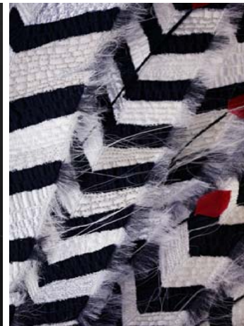
Upper left: Lisa Harkins attaching legs to canvas, Upper right: Machine Quilting a Feather Lower left: Collections I © Lisa Harkins - Theme: Birds, Lower right: detail