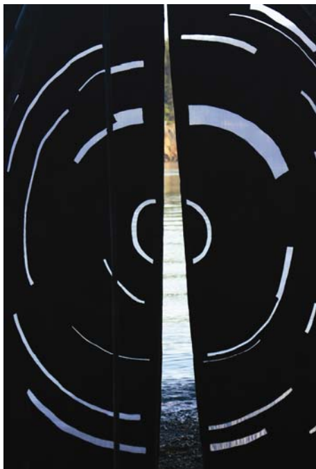
Interior shot of Tent inspired by Boyne Valley Stones