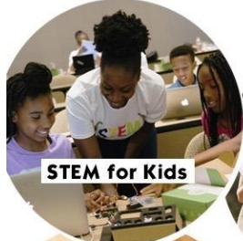
STEM for Kids