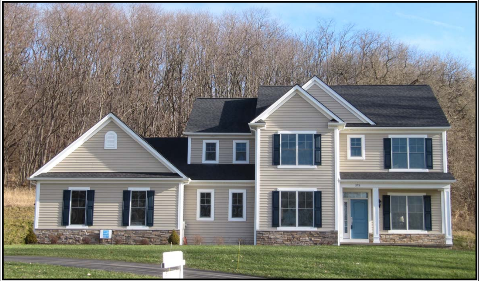
Lot 8 Arbor Glen - Victor, NY