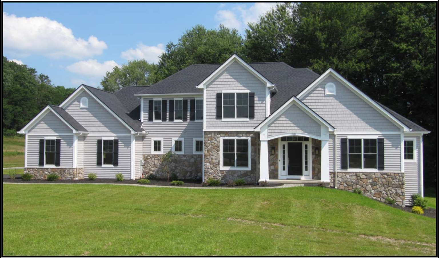
Lot 2 Arbor Glen - Victor, NY