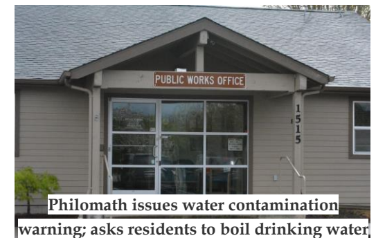
Philomath issues water contamination warning; asks residents to boil drinking water