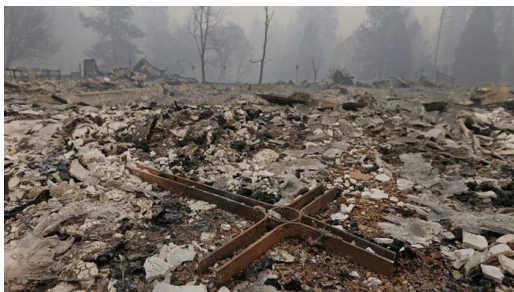
Our Savior Lutheran Church, Paradise, CA Nov 2018