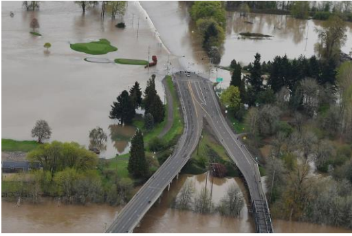
Corvallis - Highway 34 - April 2019